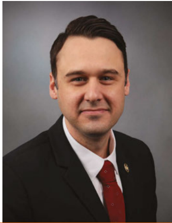
Senator John Rizzo